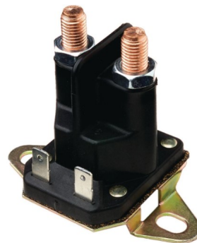
Cole Hersee Solenoid - SPST Part No: 24512-10BX

Continuous Nylon Solenoid SPST normally open (one circuit) 2 blade, 2 stud, 2 copper studs Insulated coil terminal 10-32 F bracket, Nylon housing