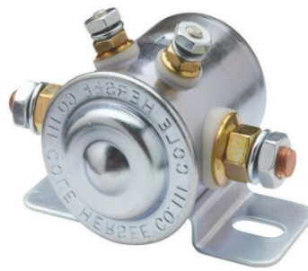
Cole Hersee Solenoid - SPST Part No: 24213BX

Continuous Duty, Insulated Earth Used in direct current wiring system Copper stud terminals 5/16" Insulated coil terminals 10-32 Strong plated steel housing