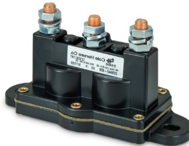
Cole Hersee Solenoid - DPDT Part No: 24450-02BX

Twin motor reversing, Intermittent For reversing motors of various types F bracket, Copper contacts Two blade coil terminals, Black nylon, Fittings included