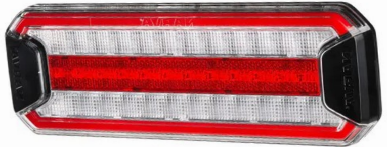
L-97010 - Rear Combination Lamp Narva, Stop/Tail/Indicator/Reverse, 9-33v Dimensions: 223 x 103mm