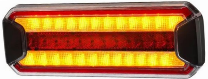
L-97000 - Rear Combination Lamp Narva, Stop/Tail/Indicator, 9-33v Dimensions: 223 x 103mm