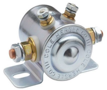
Cole Hersee Solenoid - SPST Part No: 24214BX

Continuous Duty, Insulated Earth Used in direct current wiring system Copper stud terminals 5/16" Insulated coil terminals 10-32 Strong plated steel housing