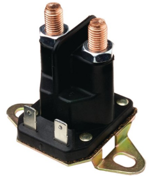
Cole Hersee Solenoid - SPST Part No: 24612-13BX

Continuous Nylon Solenoid SPST normally open (one circuit) 2 blade, 2 stud, 2 copper studs Insulated coil terminal 10-32 F bracket, Nylon housing