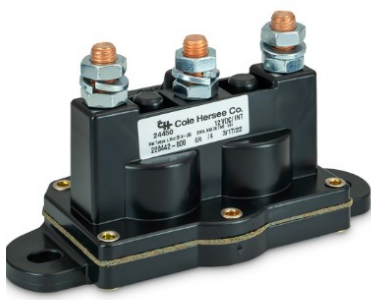
Cole Hersee Solenoid - DPDT Part No: 24450BX

Twin motor reversing, Intermittent For reversing motors of various types F bracket, Copper contacts Two blade coil terminals, Black nylon, Fittings included